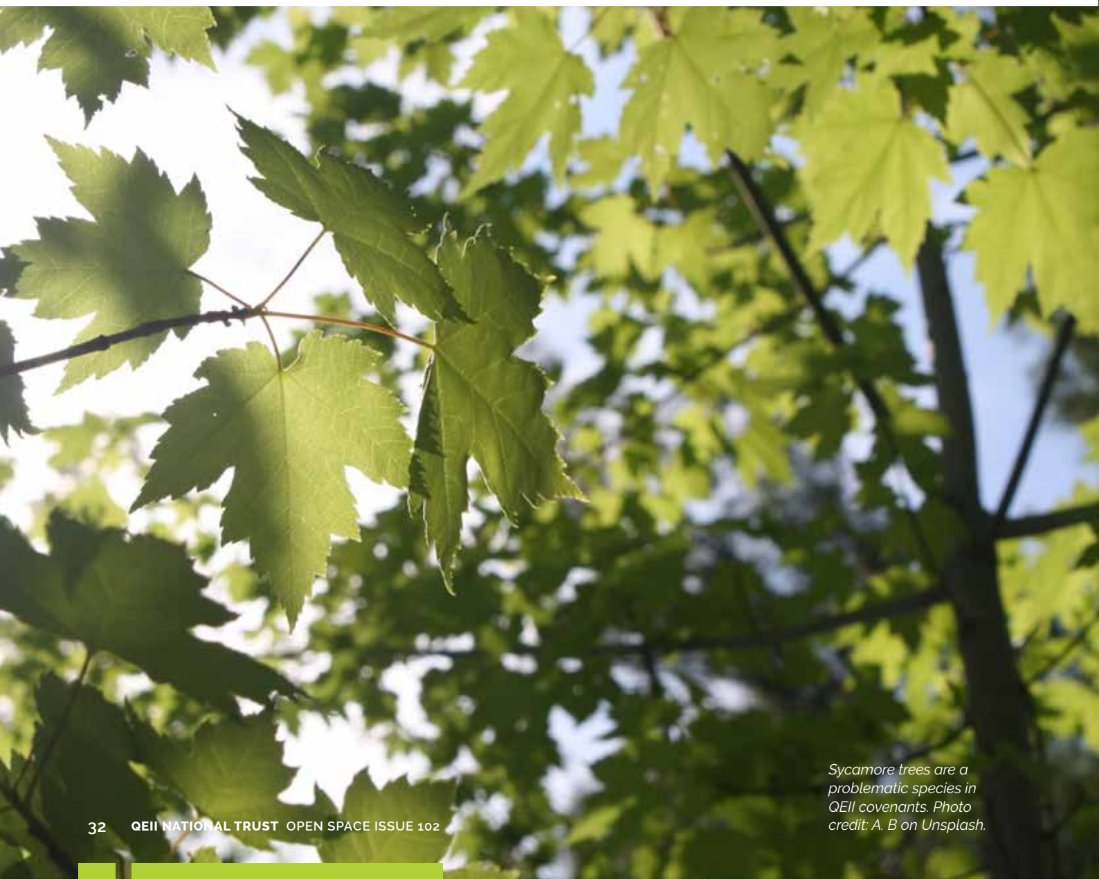
Sycamore trees are a problematic species in QEII covenants.

The last round of funding opened in August 2021 and closed in September 2021. Applications for the next round will open later in 2022. An email will be sent to members when the funding round opens. If you need to update your contact details, please let us know.