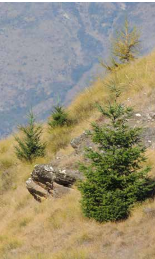
ABOVE Douglas Fir invading tussock grassland.