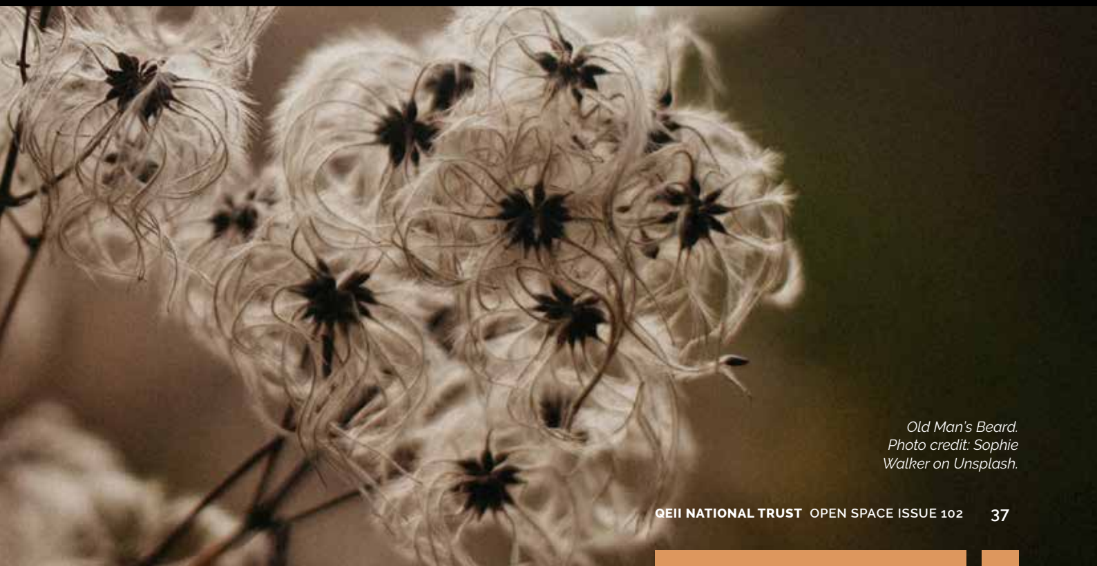
Old Man's Beard.

The original version of this article appeared in issue 81 of Open Space, October 2011. It has been updated to reflect new best practice control methods.