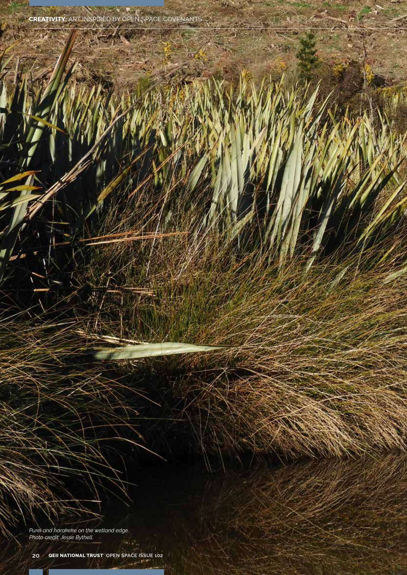
Purei and harakeke on the wetland edge.