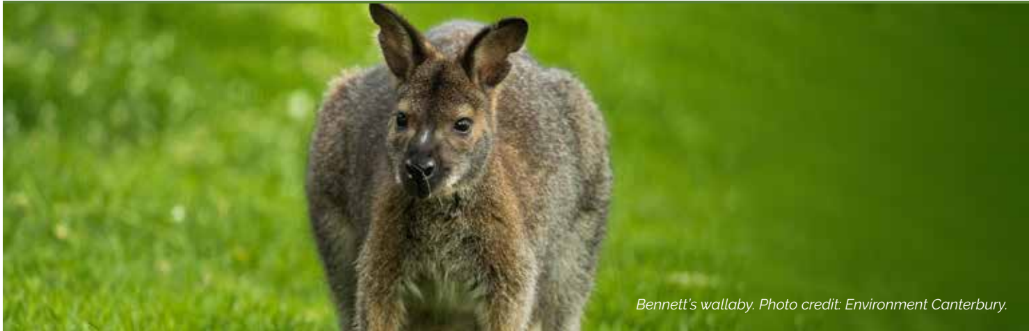
Bennett's wallaby.