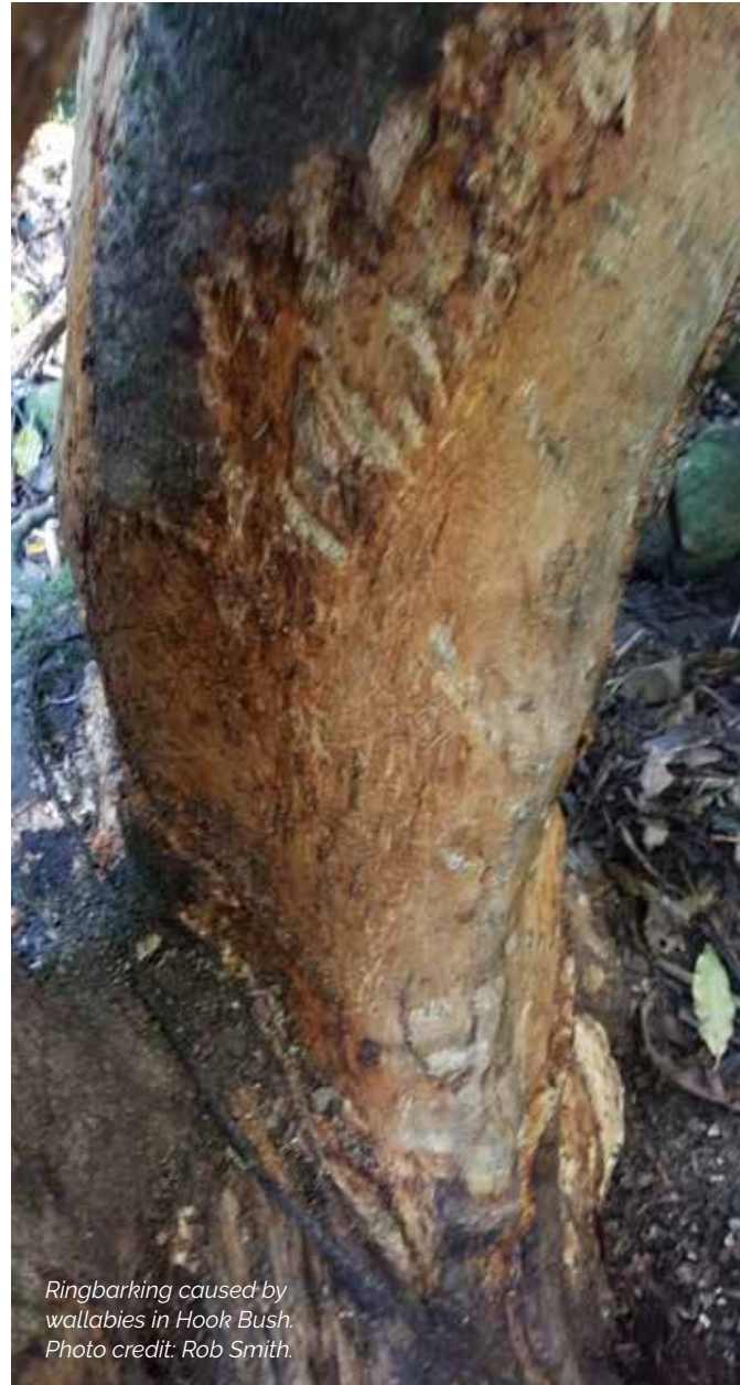
Ringbarking caused by wallabies in Hook Bush.

The Bennett's wallaby, previously found in South Canterbury, is starting to spread into Otago, threatening native ecosystems, farms, and forests in the area. If wallabies are not controlled, they could spread across one third of both the North and South Islands over the next 50 years and could cost New Zealanders $84 million a year by 2025 (includes lost farm production and ecosystem services).