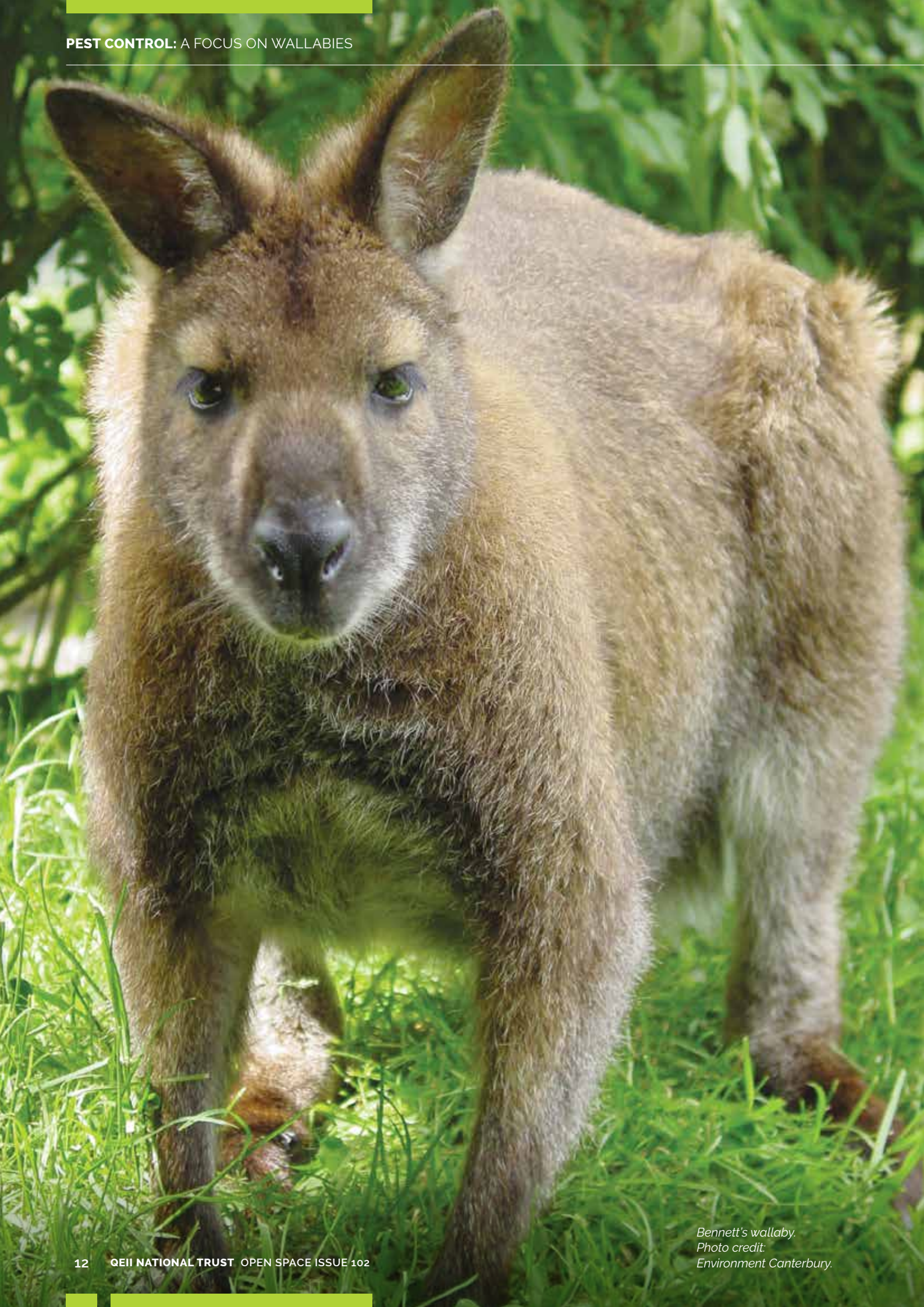
Bennett's wallaby.