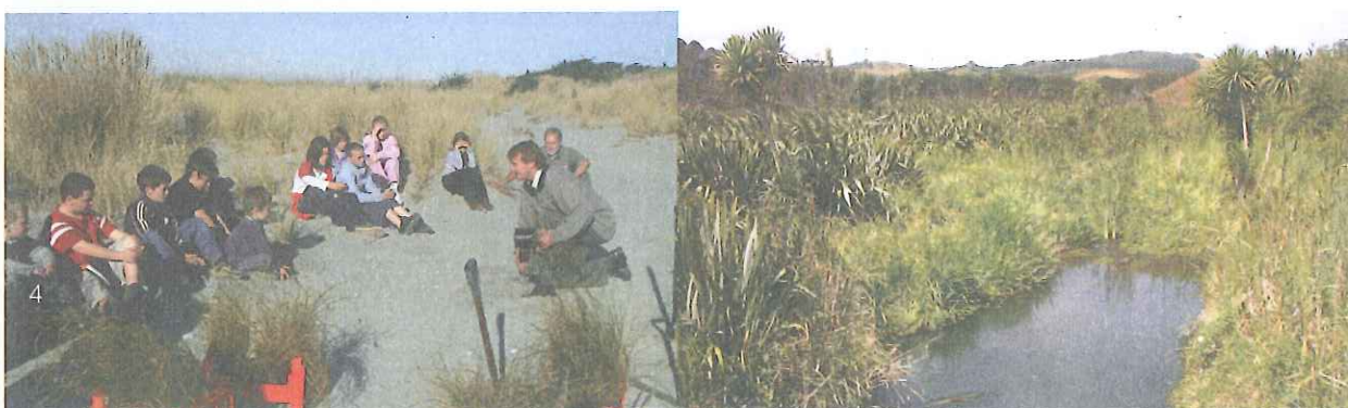
From left: DOC staff helping students plant pingao, Otago.

Only 21,300 hectares of dunelands are left in New Zealand – 11.6 percent of their original extent. Coastal dunelands are identified as a national priority ecosystem under the New Zealand Coastal Policy Statement.