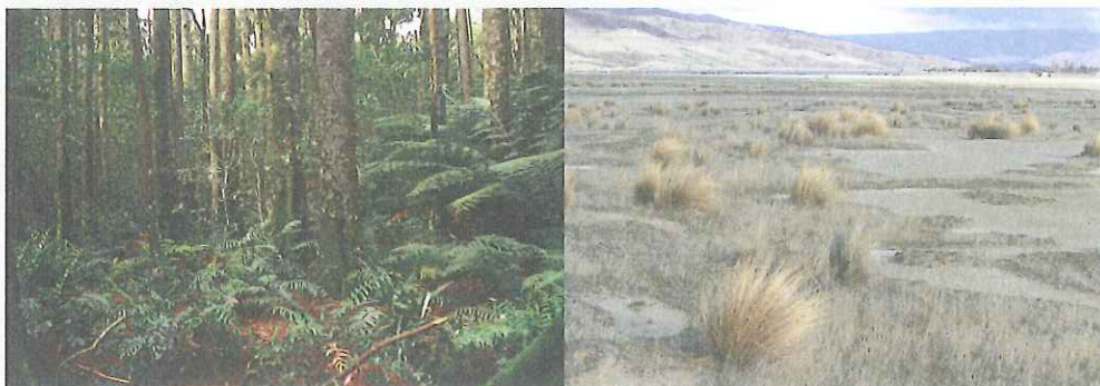
From left: Kahikatea forest remnant, Waikato.

We now know that close to 468,000 hectares of unprotected native vegetation is in land environments reduced to less than 20 percent of their original extent. This is a concern, because scientific research has shown that the rate of biodiversity loss increases dramatically when native vegetation cover drops below 20 percent of what it was before humans arrived.