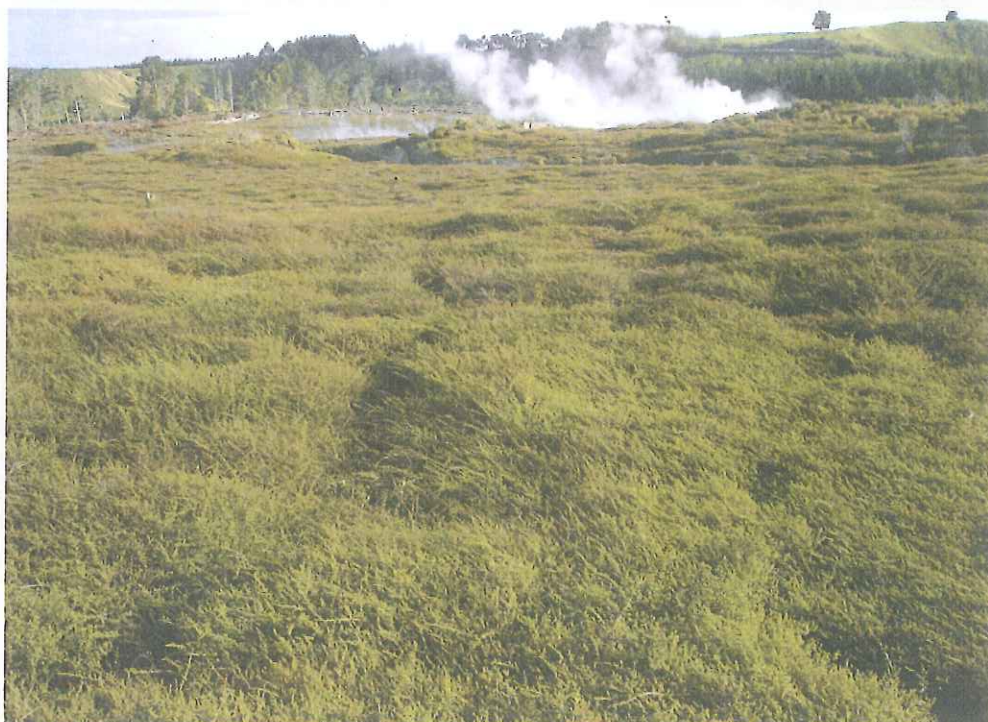
Steam rising from Craters of the Moon, Wairakei. Foreground: prostrate kanuka occurs only in geothermal areas, here, colonising heated ground.

National Priority 3: To protect indigenous vegetation associated with 'originally rare' terrestrial ecosystem types not already covered by priorities 1 and 2.